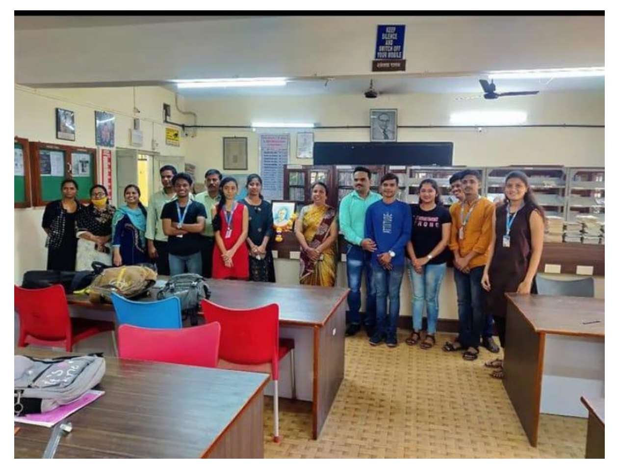
Poetry reading by students present for session